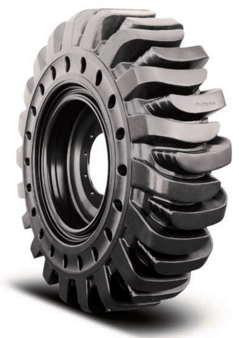
HPS Solidflex Traction