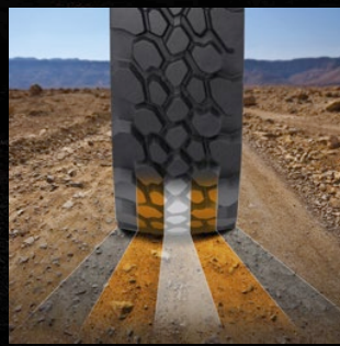
Multi functional tread design