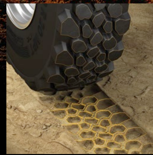
Special tread design with multiple block geometries