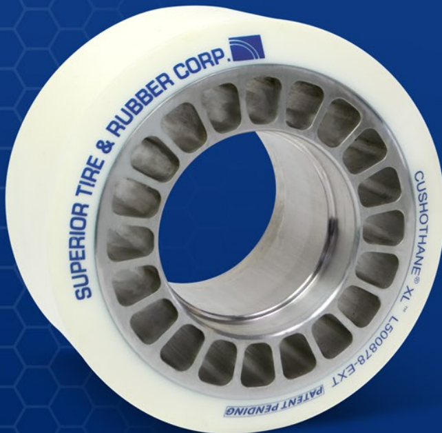
Wheel shown without bearings. Velocity™ wheels cannot be ordered without bearings factory pressed. Image is for representation purpose only.

Superior Tire & Rubber Corp.'s team of engineers have developed a revolutionary load wheel design that will change the industry. The patent pending Velocity™ wheel significantly reduces weight and can extend wheel work-life by up to 100%. The Velocity™ wheel saves customers money through lower shipping charges, reducing replacement cycles and maintenance burden.