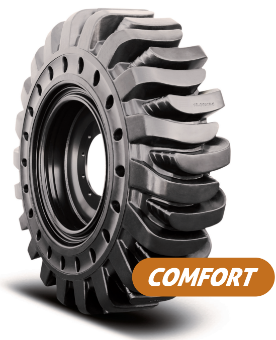
HPS Solidflex Traction