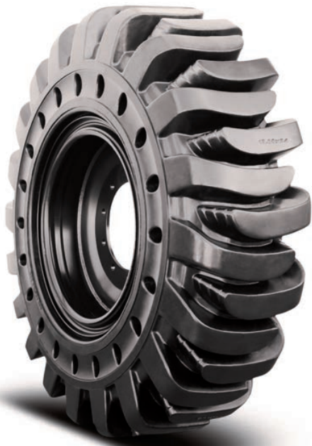
HPS Solidflex Traction