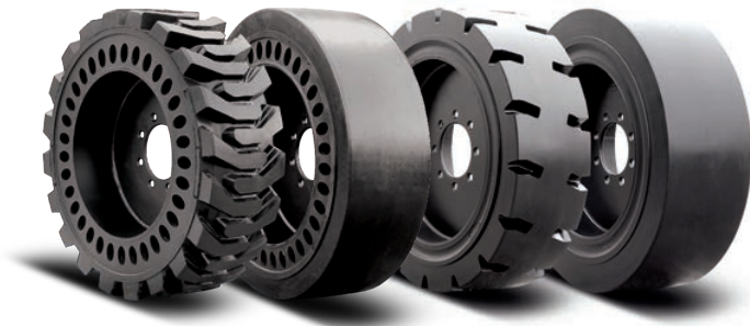
HD Solidflex Traction